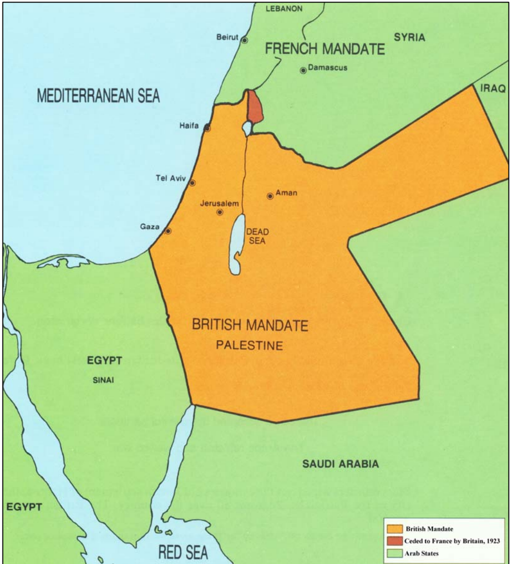
Map 1: The Jewish National Home (British Mandate), 1919